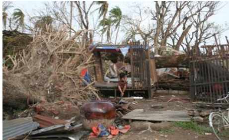
Sitting in the midst of devastation.

ABM works with the Church in the Province of Myanmar and donations to this emergency appeal will be sent to the church for immediate humanitarian relief work. ABM has already dispatched funds from its emergency reserves and is seeking to raise further funds to help in the relief efforts of the church.