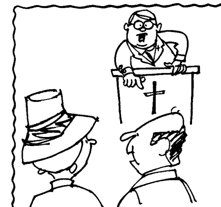
"Somehow I get the feeling his sermons are aimed at me."

Hope begins in the dark, the stubborn hope that if you just show up and try to do the right thing, the dawn will come. You wait and watch and work: you don’t give up.